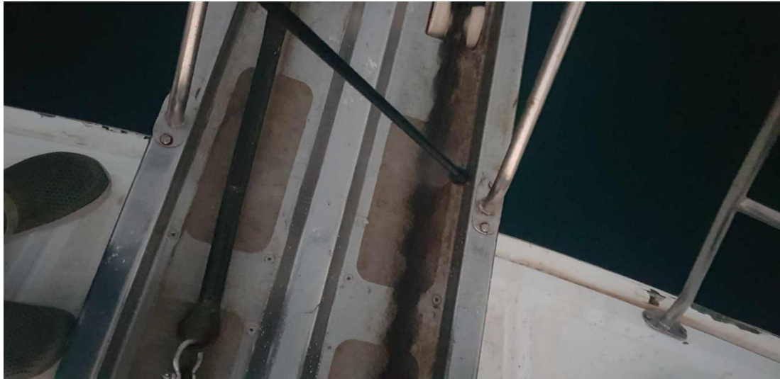
Figure 1: Anchor chain disinfection post anchoring in Port Fitzroy for the night.