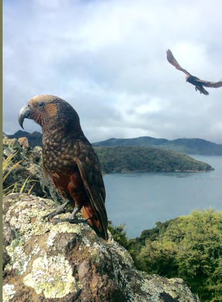
Kākā over Port Fitzroy

https://www.gbiet.org/ contact.gbiet@gmail.com