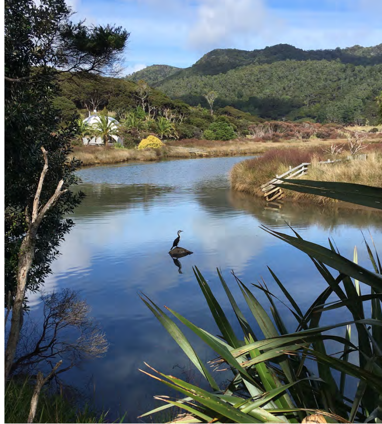
Waitematuku creek – Lotte McIntyre

For the latest updates please go to www.tumaitaonga.nz